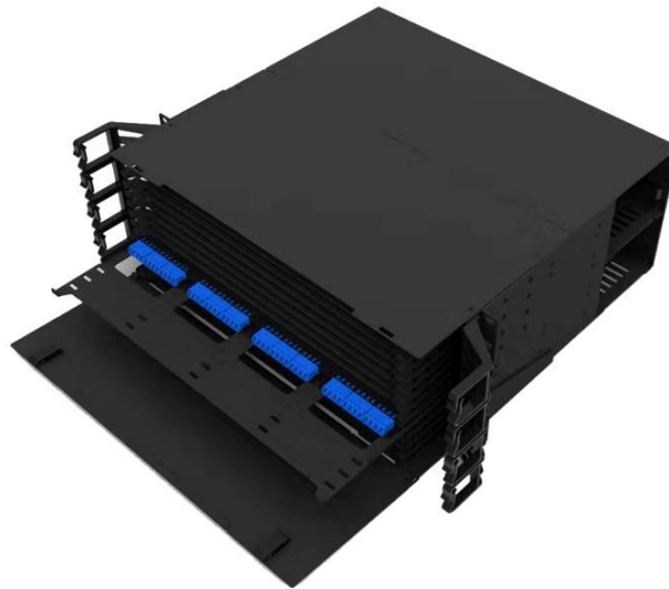
Figure 1. Giganet 4U 48 slots UHD Modular Sliding Patch Panel

Easy front access with hinged cable management bar which provides protection of the patch cords as well as labelling. Sliding patch panel is supplied unloaded and the cassette modules are supplied separately.