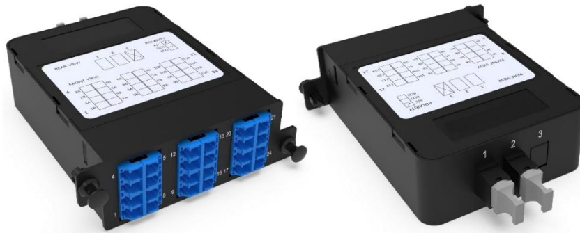
Figure 1. Gigaset HD-MTP/MPO Cassette Modules Base 12 (A and C)

Gigaset HD cassettes are pre-terminated modules MTP/MPO-LC/SC fanouts that are suitable for up to 100G applications to interconnect backbone with discrete connections. The HD cassettes are designed to easily plug into Gigaset HD chassis and each chassis can populate up to 96F. The cassettes eliminate the need for splicing reducing costs. The MTP/MPO and single ferrule connectors are available in Standard and Premium versions to cater customer's power budget requirements.