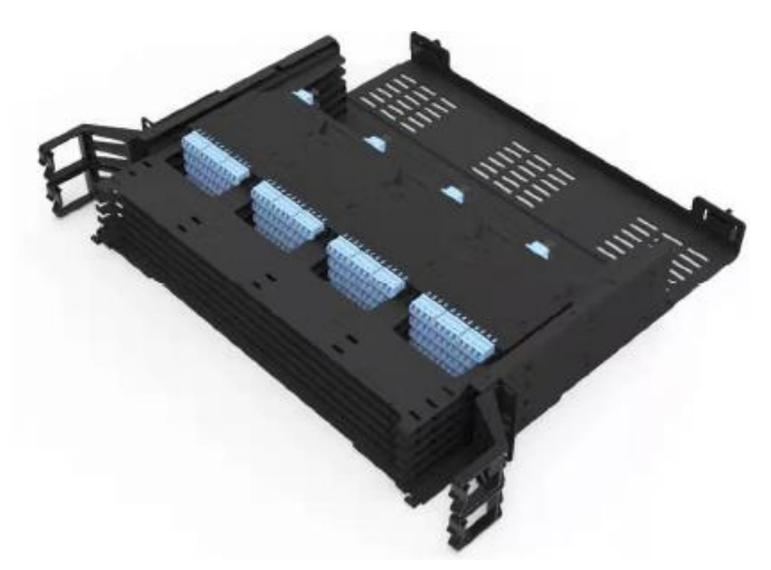
Figure 1. Giganet 2U 24 slots UHD Modular Sliding Patch Panel

Easy front access with hinged cable management bar which provides protection of the patch cords as well as labelling. Sliding patch panel is supplied unloaded and the cassette modules are supplied separately.