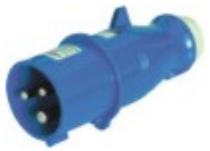
IEC60309 2P+E 16A