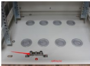
Copper Earthing Bar