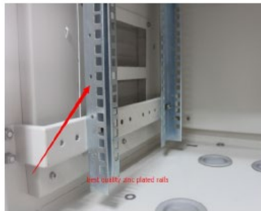
Dust-proof Metal Cover