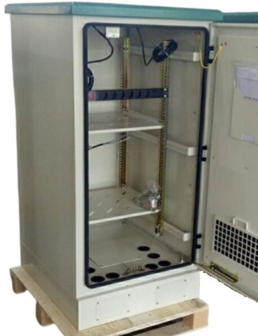
Note: Images are only for illustration purposes.

Giganet’s IP Rated Outdoor FM Cabinet offer protection against the unauthorized access, physical impacts (vandalism) Water/Dust ingress, as well as industrial environmental challenges including high temperatures Cabinets are available with integrated thermal management using either a fan and filter combination or air conditioner to control internal temperatures for protecting sensitive 19” rack equipment from water and harmful environmental contaminants and heat powder coat provides high corrosion resistance.