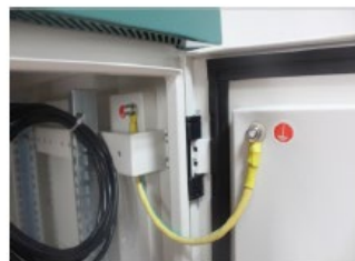
Copper Earthing Bar