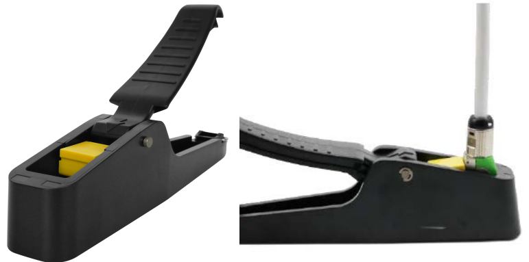
Giganet Crimping tool for Category 6A FTP Tool free Plug