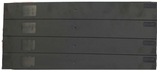
4U Blanking Panel